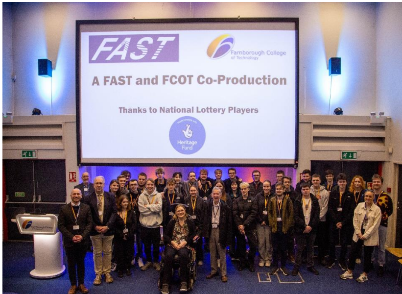
Film Premiere event at FCOT, 'A Celebration of British Aviation' showcasing the aviation documentaries produced by Year 2, Level 3 media students.