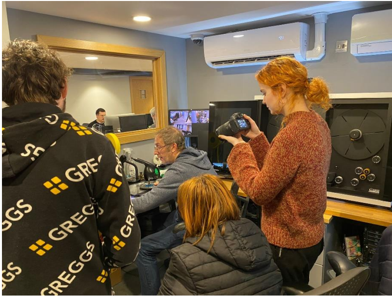
Students visiting The Ark Post Production facility in London where the films were cleaned, restored and digitised.