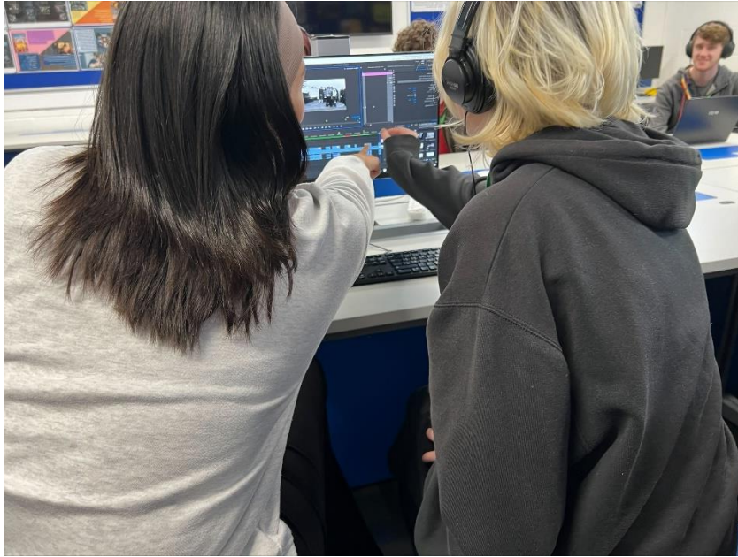
Students editing interview for museum AV installation.