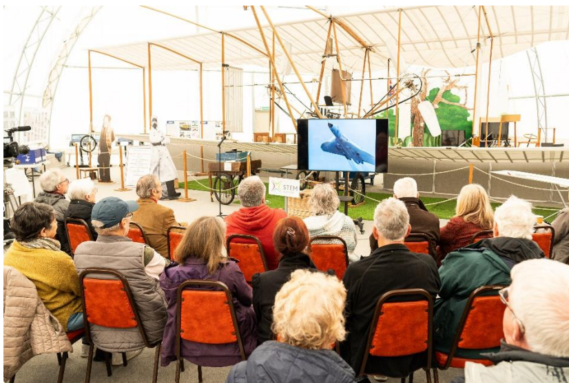
Public event at FAST showcasing archive content, student productions, and thanking National Lottery Players. The event was attended by Mayor of Rushmoor, Cllr Clive Grattan.