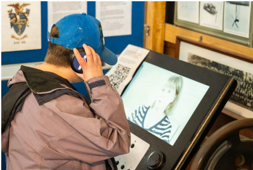
Museum visitor viewing new audio-visual installation.