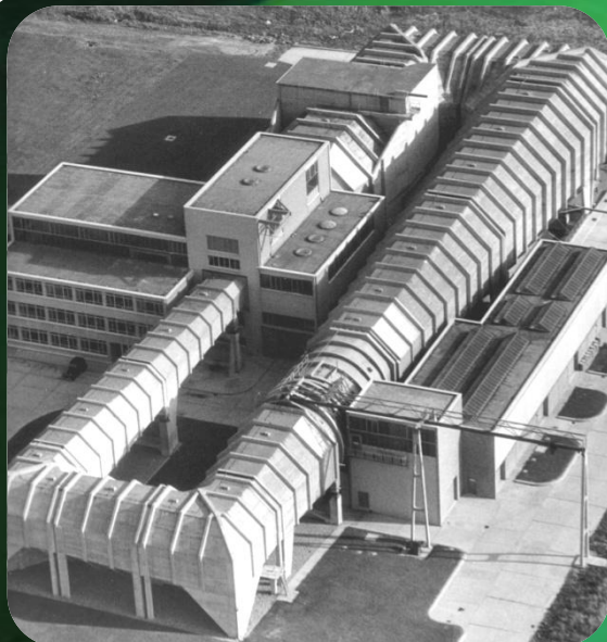
13ft x 9ft Low Speed Tunnel